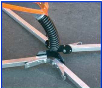
UniFlex™ Spring System