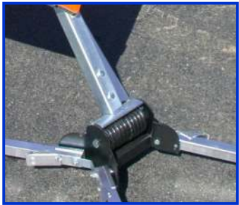
Dynaflex™ Spring System