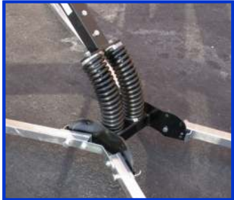
TwinFlex™ Spring System